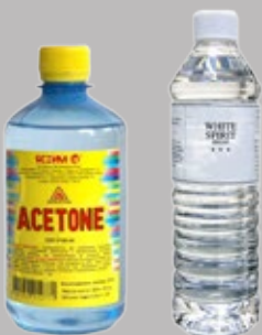
White spirit. Acetone