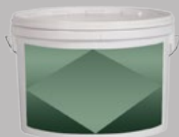
Fine grain water-soluble filler