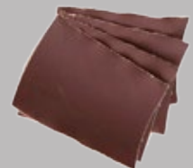
Fine grain abrasive paper