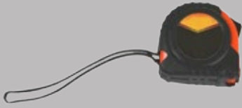
Spring tape measure