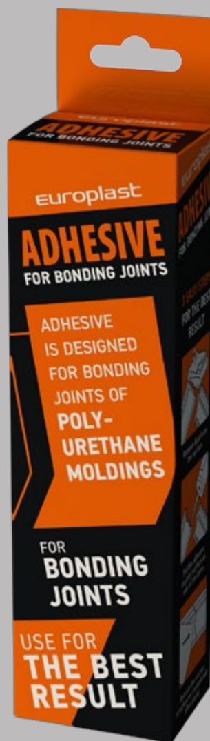
Adhesive for bonding joints

Important! The following information is relevant for Evroplast «Adhesives». If you use other adhesives , follow manuals on it's package .