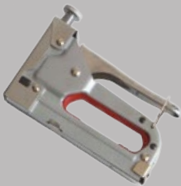
Construction staple gun