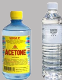
Acetone. White spirit