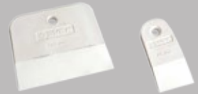
Rubber putty knife