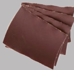
Fine grain abrasive paper