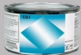
Fine grain water-soluble filler