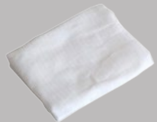
Cotton waste (Cloth)