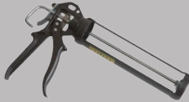
Glue applicator gun (power-actuated fastening tool)